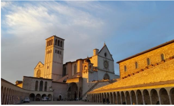
San Francesco Basilica