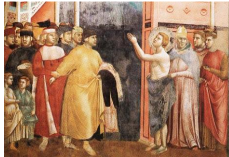
Giotto Fresco at San Francesco Basilica