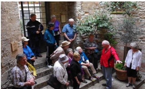
Chiesa Nuova – Home of St. Francis

** If you wish to make your own flight arrangements, please let us know at the time you send in this registration. You will be responsible to meet our group on Tuesday, April 23, 2019 either at the airport in Rome or at our hotel in Rome (details to be provided upon registration). If you book your own flight, the first payment is still $500 per person, but the balance due by March 1, 2019 is reduced to $2,450.